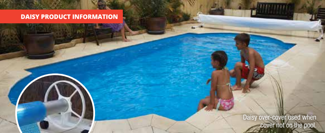
Daisy over-cover used when cover not on the pool.

Once installed, your cover and roller are easy to move away.